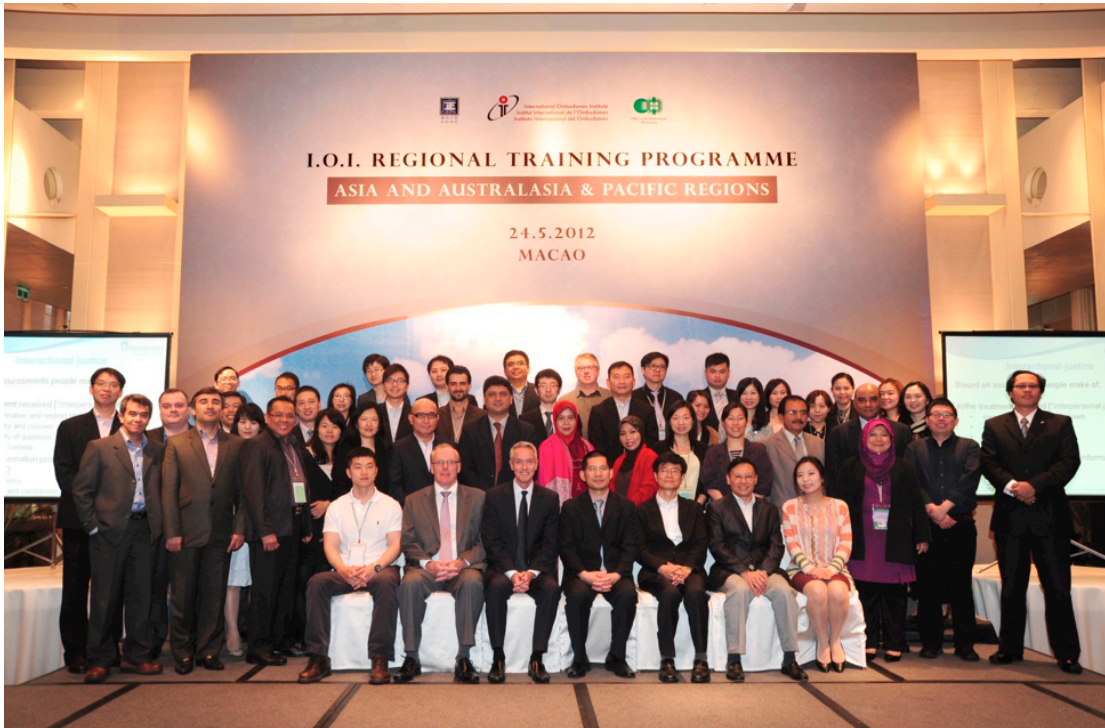
Training in Macao with colleagues from IOI.

disputes online using Skype. This promises to be a useful tool specifically for me.