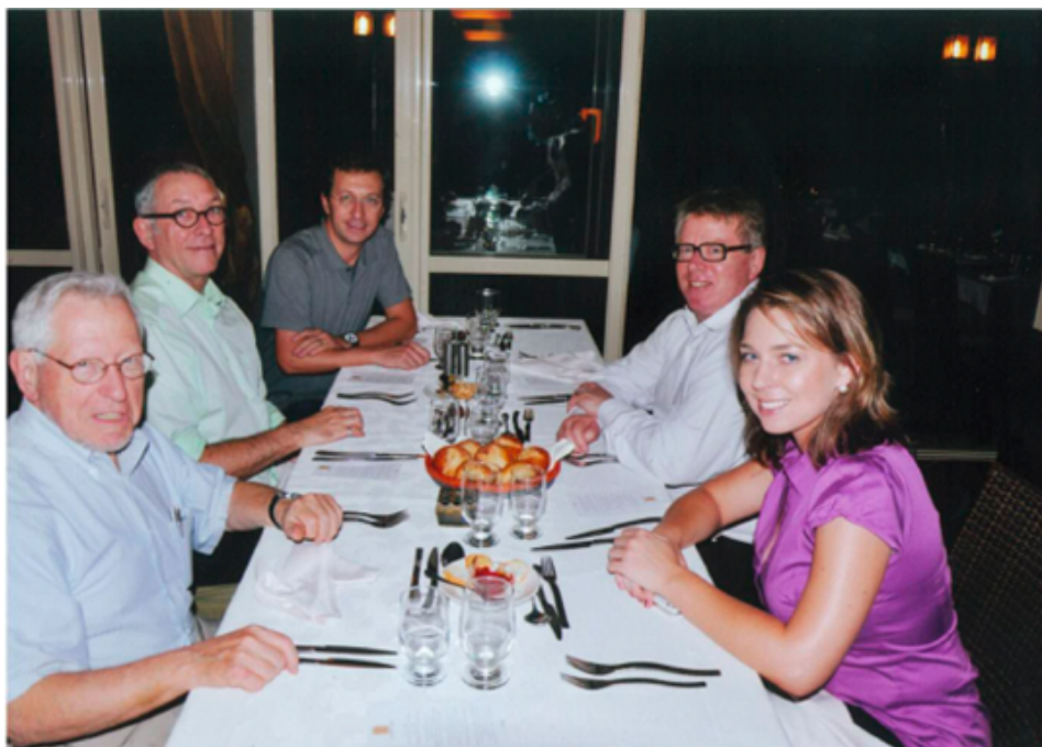
Meeting Board and staff in Dakar.